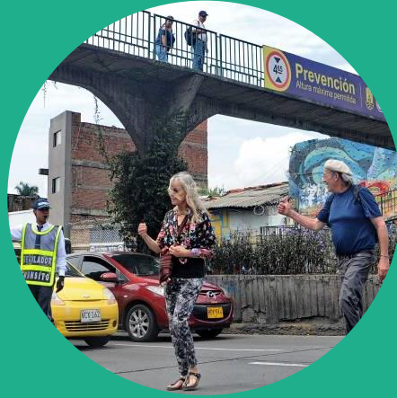
2 - Accessibility