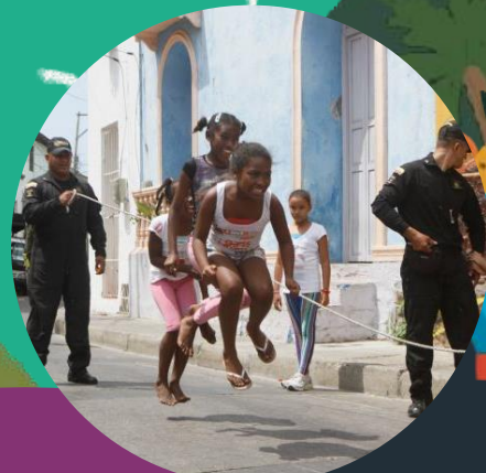
6 - Livable Streets