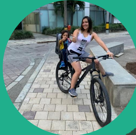
3 - Diversity