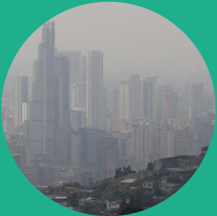
4 - Coherence with climate challenges