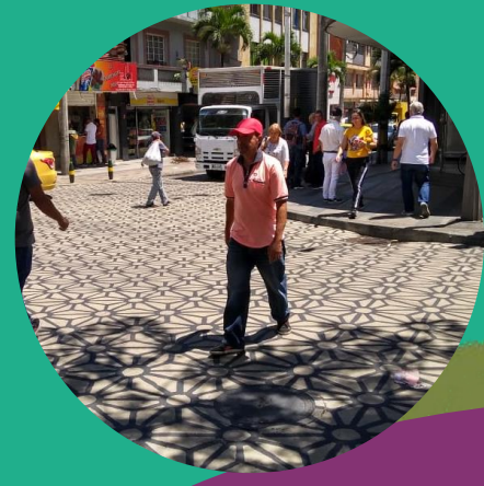
5 - Saving lives