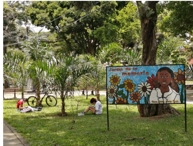
Palmira, Valle del Cauca.