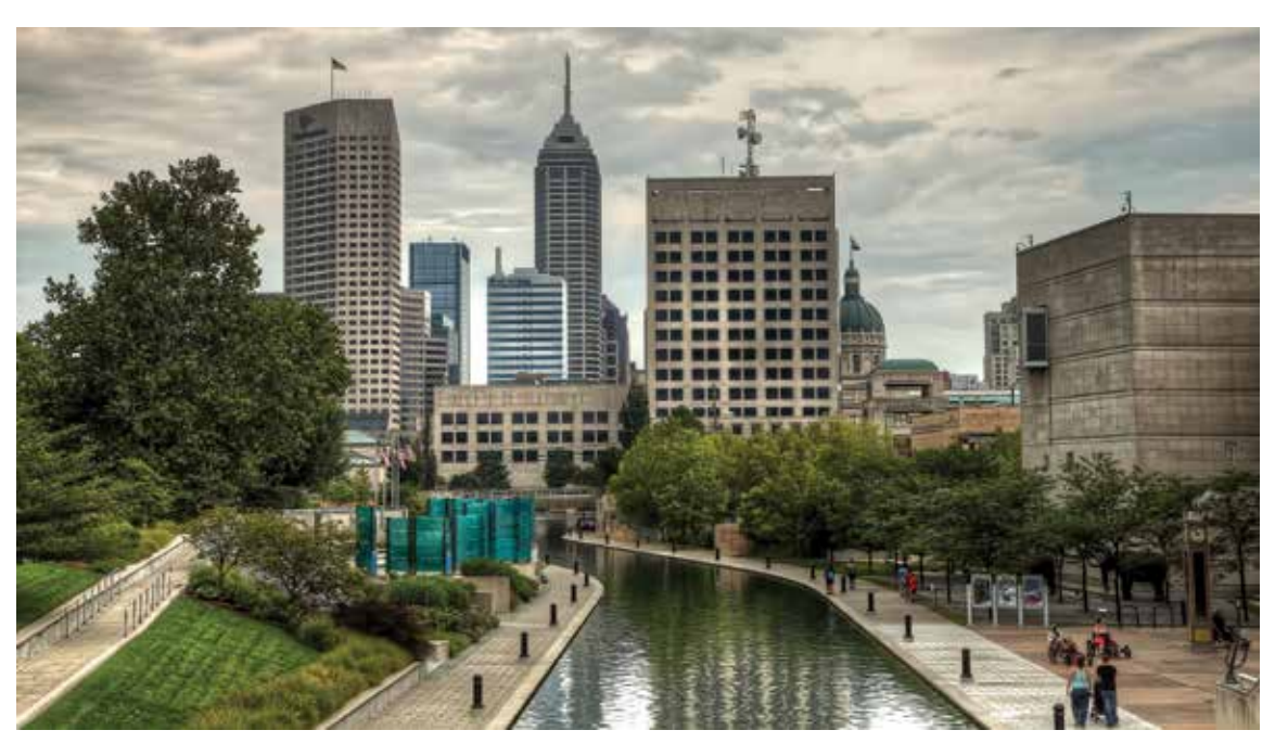
Downtown Indianapolis is using a shared parking approach while pushing forward better cycling and walking amenities leading to a more compact, mixed-use city center.