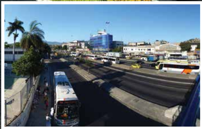
Avenida Brasil before its reimagining.