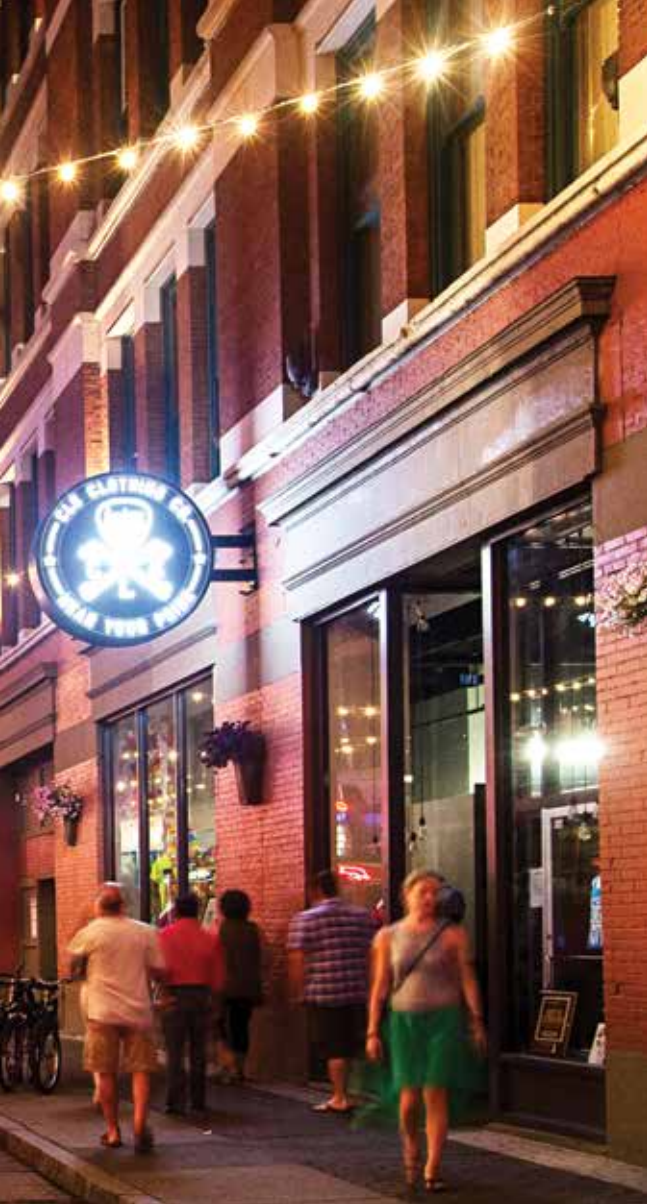
Left: Neighborhoods along Cleveland's HealthLine BRT corridor are bustling. Bottom Left: Planners and developers looking to revitalize the East Liberty neighborhood in Pittsburgh are focused on the community's BRT station as a potential economic anchor for new growth. Bottom Right: The HealthLine's construction promoted government redevelopment efforts and instigated productive public-private partnerships.