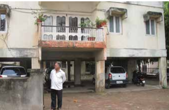
In Ahmedabad, outdated planning regulations require a stilt building with parking below the main structure to have redundant setbacks that inflate costs, reduce building size, and hurt the pedestrian environment.

Transit and parking go hand-in-glove. People want easy access to destinations. They want to be able to travel comfortably and affordably. If a city allows development in an area without transit then driving is the only feasible way to get around, especially if that development caters to middle-to-upper income residents who can afford a private vehicle. This type of development exists on the western periphery of Ahmedabad, where gated communities of taller buildings with good plumbing and modern amenities are rising (along with car use) far from the transit of Janmarg.