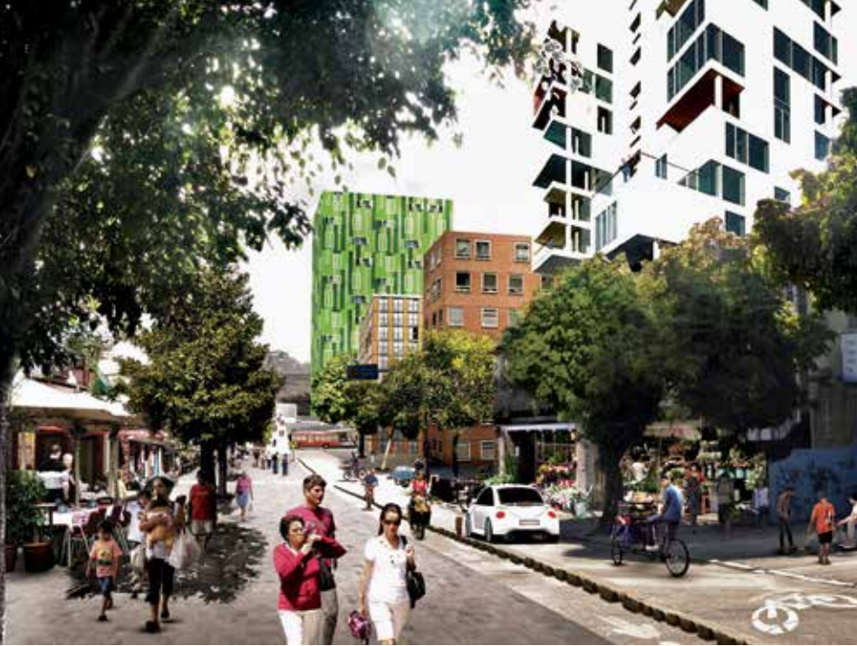
A rendering of Avenida Paris in Rio de Janeiro, Brazil, shows the density, bike- and pedestrian-friendly design elements, and mix of commercial and residential uses that are essential elements of Transit-oriented Development.

passenger 40 minutes per trip, or about 14 days a year. If we put a value on this time savings, using one-third of the average hourly wage for the city, TransOeste is saving its users 70 million Reais per year, or 35 million U.S. dollars.