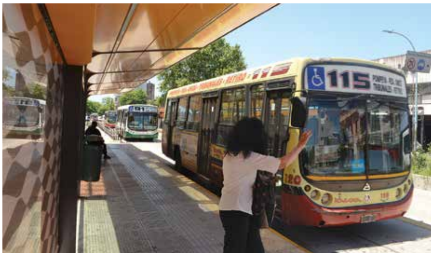
The Metrobus Sur BRT corridor implemented in September 2013 aims to encourage development and density in the eight surrounding neighborhoods.

Metrobus Sur's designated lane will benefit 18 other bus lines. Residents of the eight neighborhoods along the corridor have already seen a 15 percent commute time reduction, and a reduction in traffic noise and pollution. The project is expected to have development impacts on these