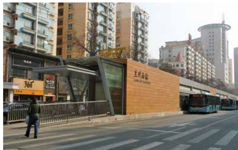
Left: Several BRT stations, including Taohai Shichang, shown here, connect directly to shopping through pedestrian passageways. Right: Street-level access, as seen here at the Xi Zhan station, is the preferred way for pedestrians to reach BRT stations. Stations can also be reached by pedestrian bridges and underground passes.

the BRT Standard Technical Committee and will likely achieve Gold Standard when a planned integrated bike sharing system opens in late 2013.