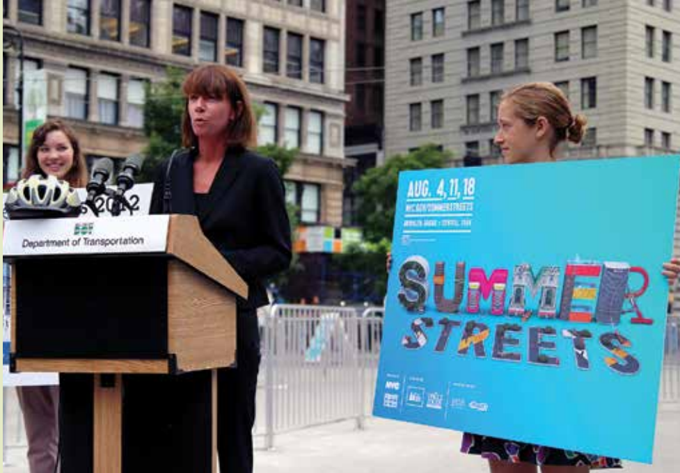
Commissioner Sadik-Khan at the 2012 Summer Streets launch event.

under your guidance. At the end of your tenure, how close will we have come to your ideal vision for New York's bike infrastructure? How about its bike culture?