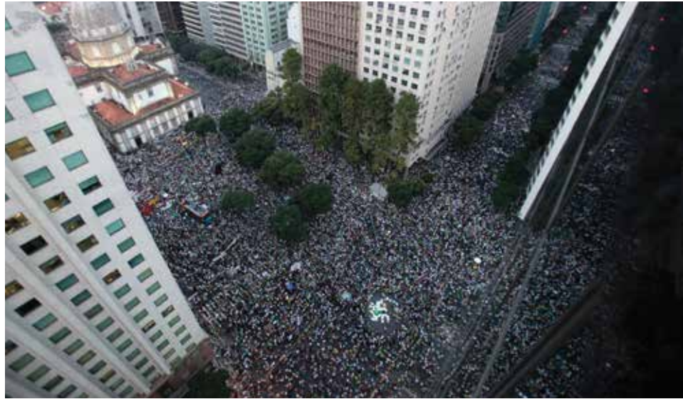
Millions of Brazilians took to the streets last June to protest an increase in bus fares.

Brazilian cities in the last 40 years have followed the global pattern of heavy invest-