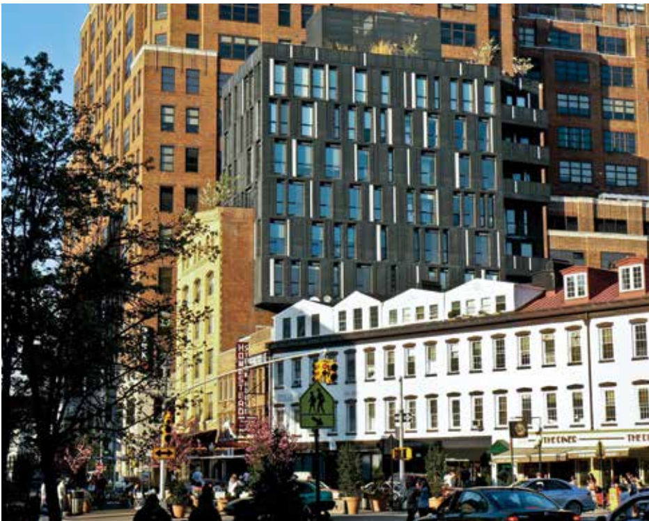
In New York City's Chelsea neighborhood, developers have taken advantage of zoning that allows increased density near transit and a parking-space cap that ensures the neighborhood remains a world-class destination.

buildings and 20 percent of floor area in all residential buildings along Janmarg. These are increases in the requirements from the old regulations of 15 percent of floor area for residential and 30 percent of commercial floor area. Such a measure would impact ridership on Janmarg's BRT by enabling easier access to driving and also exacerbate traffic congestion