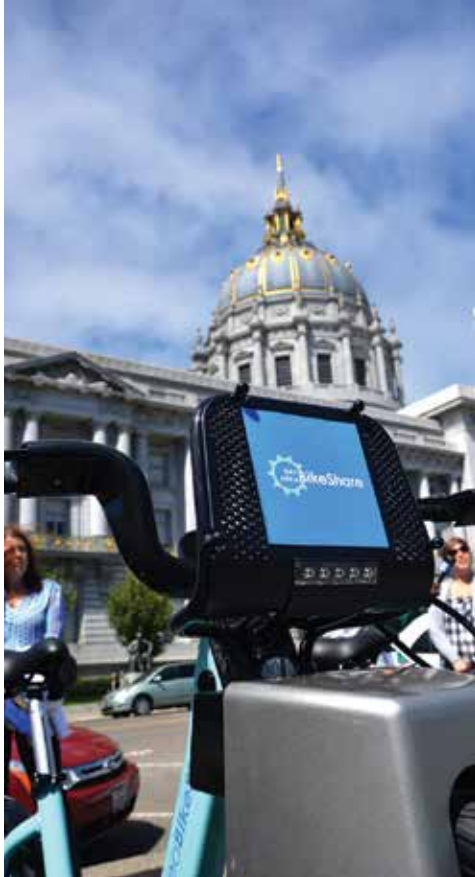
Bay Area Bike Share opened in August with 700 bicycles at 70 stations.

cycling-focused model of development. In particular, the growth in bike share has the potential to influence the creation of bike share in regions, such as Africa, India, and Southeast Asia, where bike share has yet to take hold.