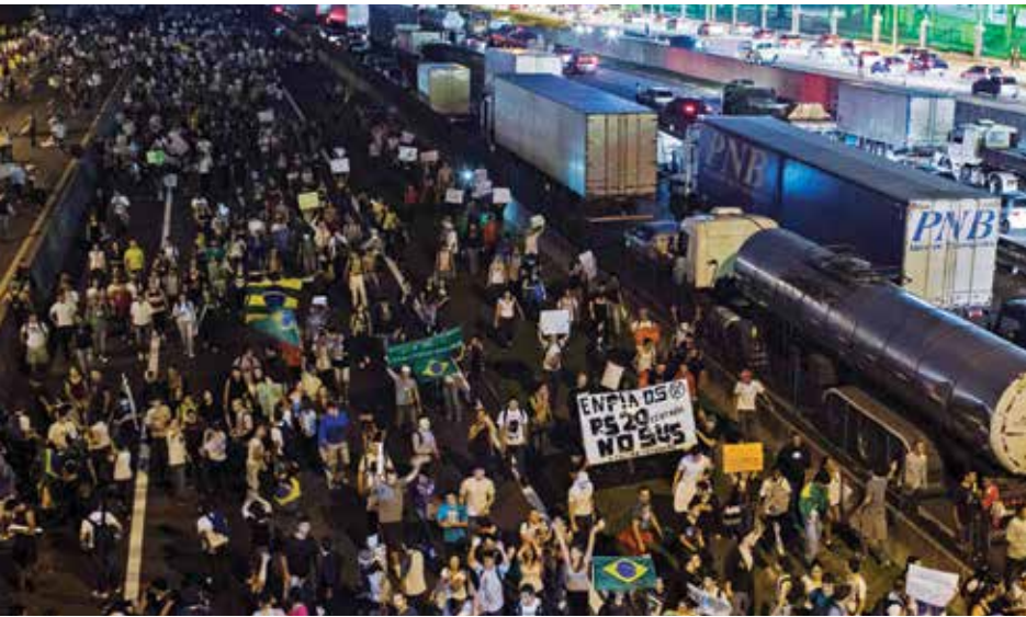
Protesters crowd on to one of Rio de Janeiro's main highways.

FIFA World Cup in 2014 and the 2016 Olympics have given many of these projects, particularly transportation-related undertakings, a heightened sense of urgency.