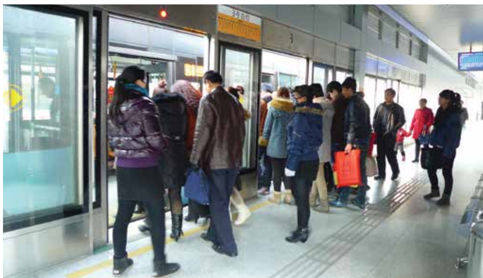
Above left: Lanzhou’s new BRT station configuration, seen here at Sizhong Station.

Modal integration is a feature of the project as well, with double-tier bike-parking racks provided at the major BRT stations, a bike-sharing system and greenways planned, and bike lanes along the BRT corridor. Following ITDP’s promotion and subsequent planning and design input over the last few years, Lanzhou aims to launch a citywide bike-sharing system this year. The Lanzhou Communications Commission is in charge of the project. The Lanzhou Bus Company, which has already set up a subsidiary bike-sharing company, will be the operator. Several officials from the Communications Commission, Development and Reform Commission, and Lanzhou Bus Company carried out