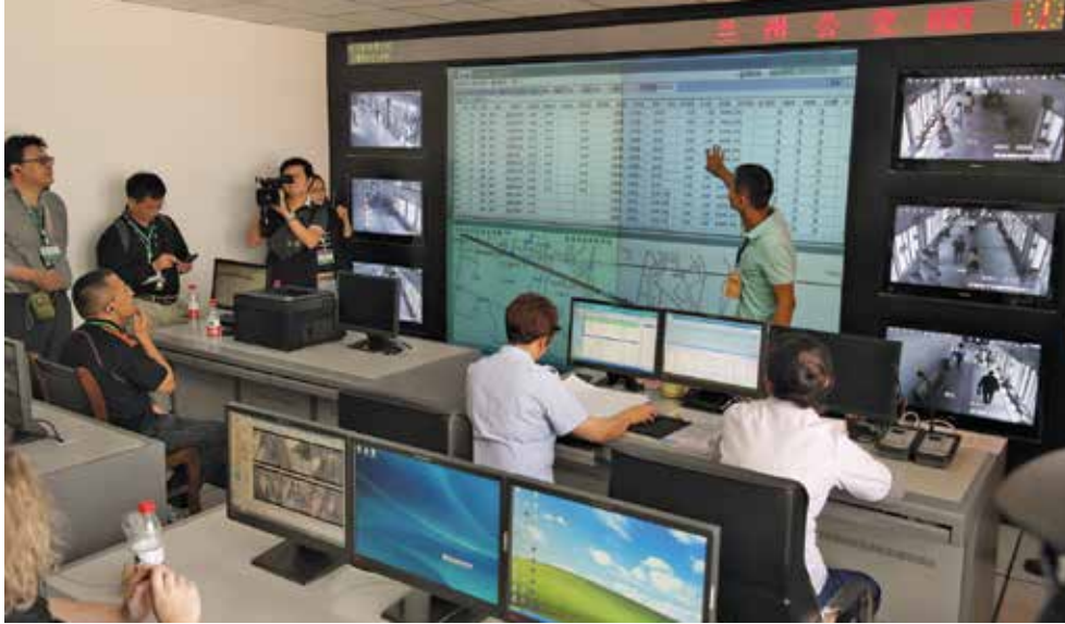
The Lanzhou Bus Company has improved its performance and service levels in the BRT corridor.

a study trip to Hangzhou, Shanghai, and Zhuzhou earlier this year. The Communications Commission is planning to choose a latest-generation, high-quality system. Lanzhou is currently waiting to hold a municipal executive meeting to discuss the budget of the bike-sharing project, and started the bidding in September 2013. The total budget for Lanzhou's public bicycle system is 100 million yuan (US $16.34 million), with 50 million yuan allocated for the first phase, which will include 500 stations with 12,000 bikes and 14,000 docks spread through the Chengguan district (the city center), Qilihe District, and Anning District (the BRT corridor). A subsequent phase, slated for 2015, will expand the program to 900 stations, 20,000 bikes, and 24,000 docks, covering the Xigu district and improving city-center coverage, and a final stage will bring the system to the suburban areas of Lanzhou.