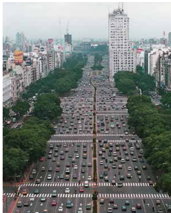
Opposite page: New Metrobus Corridor along Buenos Aires’ 9 de Julio Avenue. Above: Before its transformation, many saw 9 de Julio Avenue, at 110 meters wide, as an essential part of the city.

After the city government found success with a BRT corridor along Juan B. Justo Avenue in 2011, they quickly realized that growth, development, and prosperity had a new symbol: bus rapid transit, and they set out to apply it