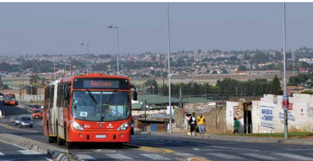
This low-density corridor along Johannesburg's Rea Vaya BRT would benefit from the sort of TOD proposed by the Corridors of Freedom initiative.

of land located at least 20 kilometers from a city center, according to a report by Jones Lang LaSalle, an international financial and professional services firm specializing in real estate.