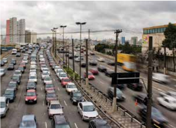
Brazilian cities in the last 40 years have followed the global pattern of heavy investment in roads, with tunnels and elevated highways reshaping cities to facilitate motorized transportation.

In the weeks following the gatherings, the federal government announced a National Pact for Urban Mobility, which aims, among other things, to reduce the cost of transit ridership by 50 percent. As part of the Pact, President Dilma also announced a new funding package with an additional $25 billion for mobility, though it is still unclear how these funds will be allocated. These are heartening signs. A shift in the