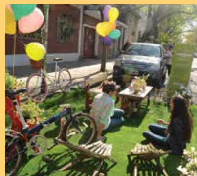
Publik Jakarta in Menteng Square.

The theme for 2013 was “Park It and Relax!” In Rio, ITDP Brazil partnered with Studio X and Transporte Ativo, and used the event to launch a “pocket version” of downtown cycle routes. ITDP Mexico partnered with other local NGOs on an event in the neighborhood of Colonia Juárez, and used the event to engage the media on the value of street space. ITDP Argentina hosted a full block of pocket parks, with seven parks total, and the event was covered in the country's most popular newspaper, Clarín . In Jakarta, ITDP Indonesia hosted a picnic, open to the public, with the NGO Ruang