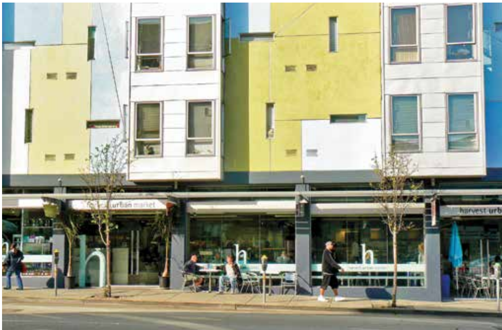
This mixed-use development in San Francisco's SoMa neighborhood combines affordable housing and retail near transit.

What's more, as cities in developing countries are working to address an affordable housing crisis and a transportation shortage simultaneously, now is the time to link the two and act in lockstep. Smart and strategic TOD could help cities around the world to address the housing/transport burden, lay the framework for a more socially and environmentally sustainable city, and ensure a future where residents will drive less, use transit more, and have better access to jobs, schools, fresh food, and health services.