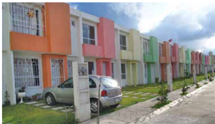
Some affordable housing developments in Mexico have a 20 percent vacancy rate, in large part due to the projects' distance from city centers and transit.

residential developers often operate in distinct silos, using different financing sources and working with different government groups, according to the Financing Equitable TOD report from Living Cities. Developers may not have the capacity to take on the more complex, mixed-use, mixed-income TOD projects, or they may not have the incentive to do so. Regardless, the outcome—as