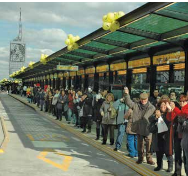
Bus passengers have reduced their travel time by an average of 30 minutes per bus ride.

along the city's most famous street on a suitable scale. They would build 17 stations along the 3.5 kilometers of 9 de Julio Avenue in order to accommodate 11 bus lines circulating about 200,000 passengers daily.