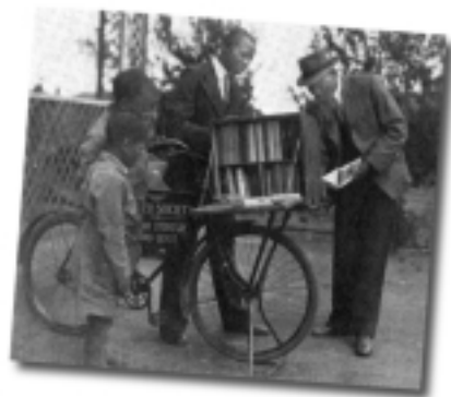
Back in the day: Dhlomo's first non-motorized bookmobile, circa 1930

Herbert Dhlomo, essayist, poet, playwright and editor of the first Black South African newspaper, "Ilanga" (The Sun), attached a large box to the front of his bicycle in 1930, filled it with books, and rolled out the first of his famous non-motorized libraries. Sol Plaatje, the first Secretary General of the African National Congress (ANC), biked coast-to-coast in 1912. Plaatje's mission was to warn rural communities of the impending Land Act of 1913, which precluded Blacks from owning property.