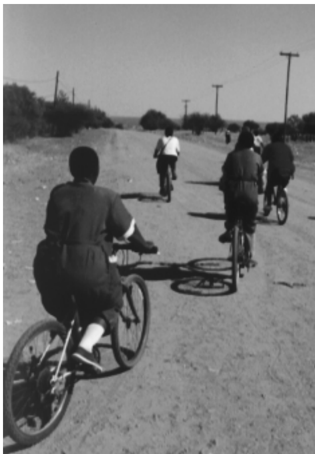
Biking to the Sisters of Mercy Center

Afribike and the Mercy Community College are planning three more trainings within the next 5 months, serving an additional 75 aspiring mountain bik-