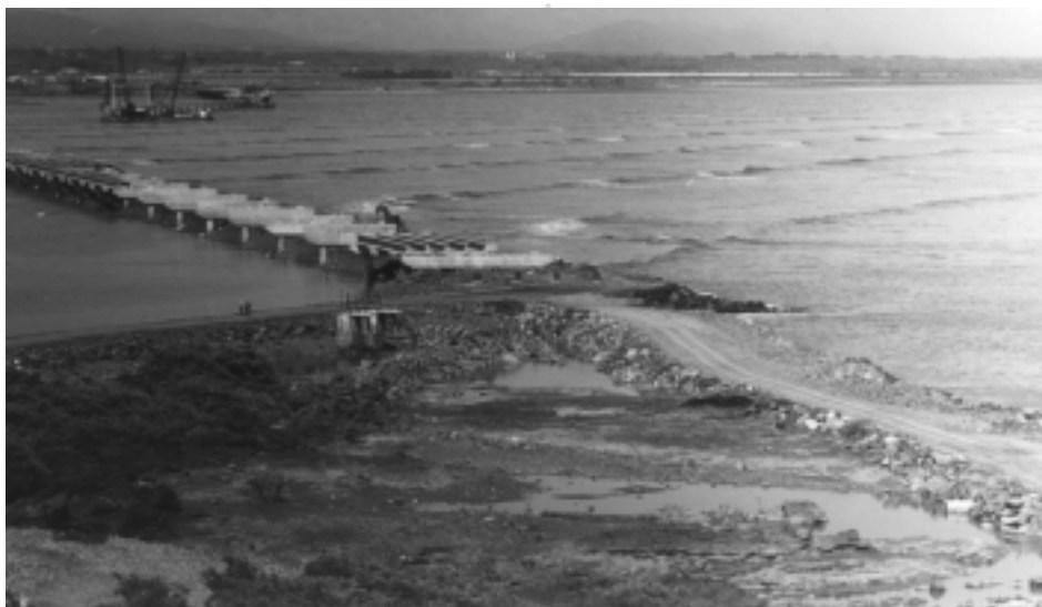
Corredor Sur Highway, Panama City

The highway continues to be built partially on a causeway just forty meters off the coast of Panama City, creating a cesspool of trapped sewage and contaminated run-off right in front of several coastal communities. The project was only financially viable because of cross-subsidies from a speculative real estate venture called Punta Pacifica, to be built on land fill in the bay of Panama. No environmental impact assessment was even done on this venture. After major demonstrations in Panama City and a formal protest by over 20 major environmental organizations initiated by ITDP, the International Financial Corporation (the World Bank's private sector lending arm) suspended further disbursements of the loan pending a re-evaluation of the environmental impact assessment on the Punta Pacifica venture. Chase Manhattan in New York was considering a loan to the project, but seems to have backed off until the constitutional rights over the landfills