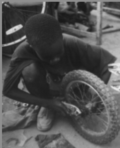
Learning bike mechanics in Haiti

In July, a jointly-sponsored ITDP/Re~Cycle (UK) shipment of 400 bikes, parts and tools arrived in Port-au-Prince to capitalize the new "Bicycle Scholars" curriculum at a new Haitian Resource Development Foundation (HRDF) school in Aquin, in southwest Haiti. The curriculum provides the training and hardware necessary for Haitian teens to enter the workforce as bicycle mechanics, shop