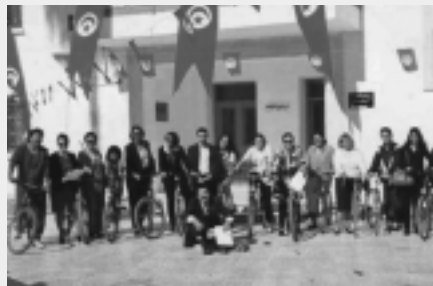
New Tunisian women bicycle commuters

increasing faster than motor vehicle ownership, and nationally there are actually more bicycles than cars. While many of these bicycles are childrens' bicycles or men's bicycles used for recreational purposes, the potential for increased bike use for commuting is enormous. And the economic benefits of such a shift would be substantial. Tunisia spent only $28.60 million on bicycles in 1994, compared to $1.06 billion on cars, not