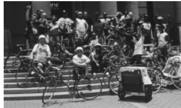
Solidarity Ride on the steps of City Hall

By early June, about 50 people had participated in the training program and received bikes. (About 35 additional bikes and some tools were sent to a rural school near Bloemfontein to capitalize their “Bicycle Scholar” program.)