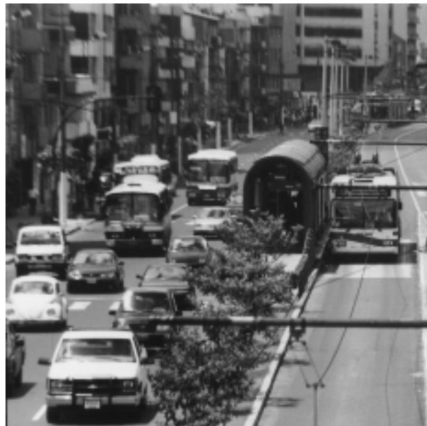
The dedicated bus lanes make the trolley bus the fastest option.

Quito was able to implement its new system despite these problems.