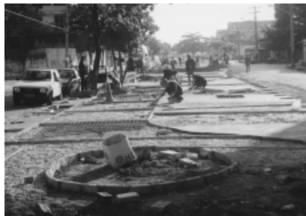
Bikeway construction in the western townships of Rio

Under Mayor Conde, an architect by training, there has been growing attention to improving bicycling. The most recent city-wide ten year transport plan, Rio Cidade II, stresses bicycle promotion city-wide, whereas the previous